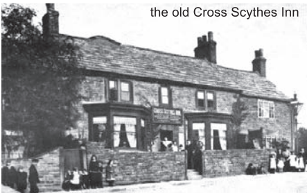
the old Cross Scythes Inn